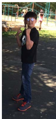
A mysterious masked hero.