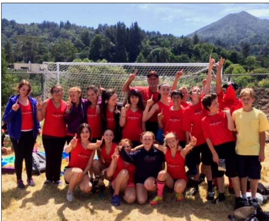
The Nicasio School Cougars at the April 24 th track meet at College of Marin.

supported the students so that they could shine in these events, and CONGRATULATIONS to all of our student athletes! We're proud of you!