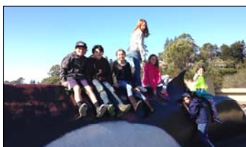
Gr. 3/4/5 students bond with a resident "whale" at the museum.

participated in a workshop about how animals adapt to their environment. The lesson included observation of live animals including turtles, crayfish, hermit crabs, chinchillas and more.