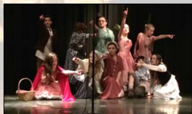
Gr. 7/8 cast of "Into the Woods, Jr."