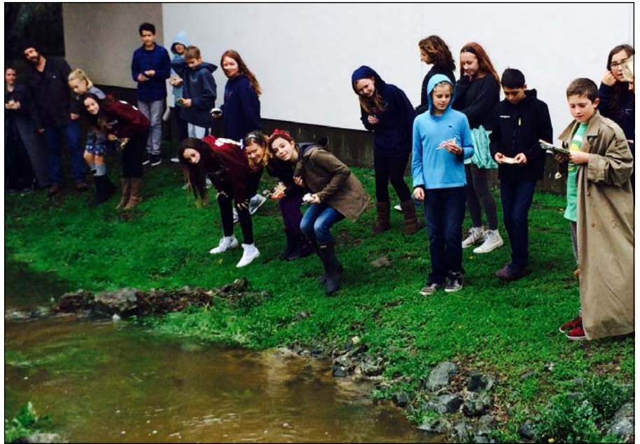
Grade 6/7/8 students coax their watercraft to the finish line of their science class regatta.