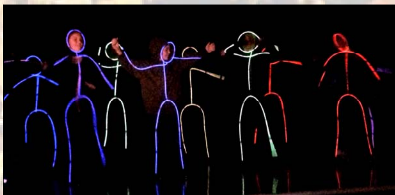
Above: Glowing Gr. 3/4 students perform to "Friend Like Me" from Aladdin.