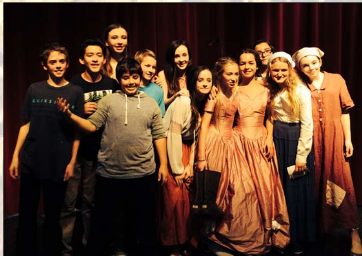
Curtain call for Gr. 7/8 cast of "Into the Woods, Jr."