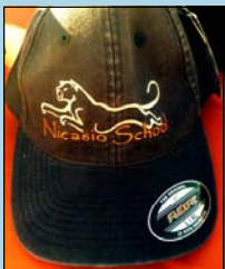
The new "Cougar" baseball cap.