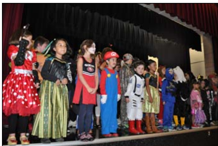
A cast of costumed characters takes the stage.

A wacky parade of costumed characters, fun buddy activities, artful tributes to departed loved ones, and a rollicking (adults only) Halloween Boo! fundraiser were among the fall events in which Nicasio School students, staff, parents and supporters took part.