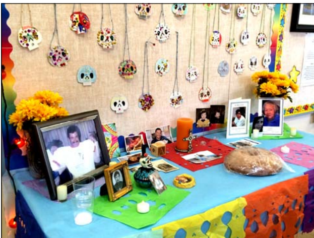
Dia de los Muertos altar was a joint Spanish/ Art class project which honored the deceased loved ones of students and staff.