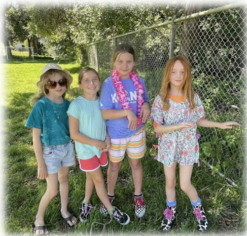
Beach Day May 10, 2024