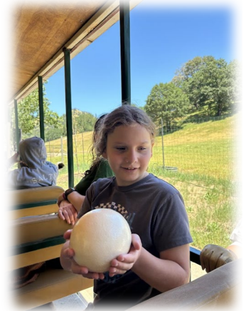
Field trip to Safari West May 13, 2024